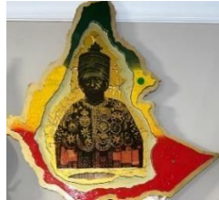
Global Amara Coalition