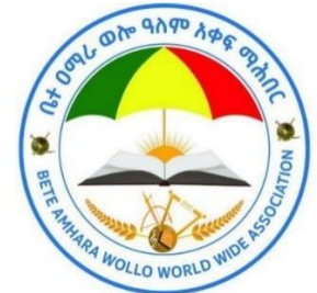
Bete Amhara Wollo World Wide Association