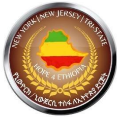
New York | New Jersey | Tri-State