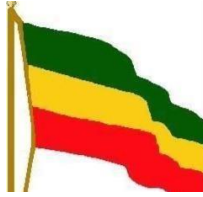
Baltimore Ethiopian Association