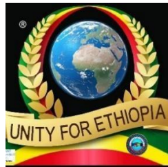
Unity For Ethiopia