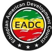
Ethiopian American Development Council